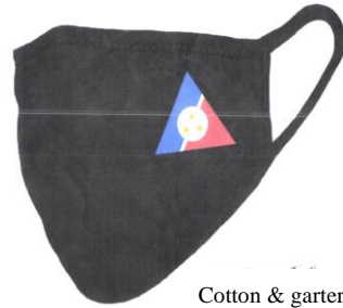
Cotton & garterized

Crown Circle Diameter: 7 - 7 1/2" Hat height/ Top of Crown to Bottom of the Ear: 8 3/4 - 9"